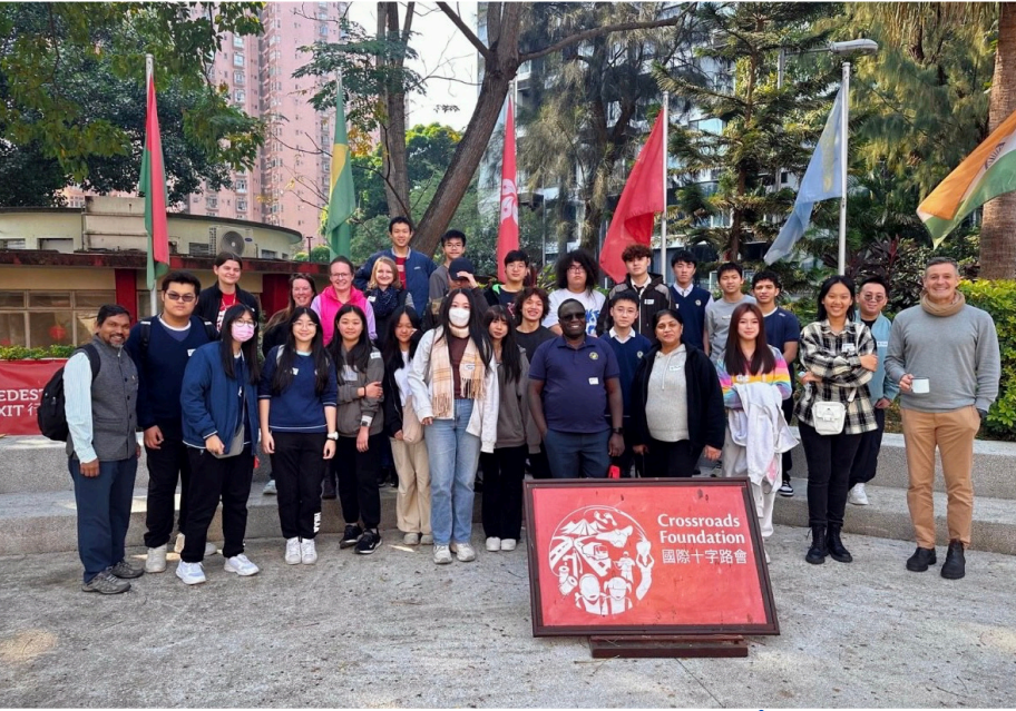
HKAA team at Crossroads Foundation