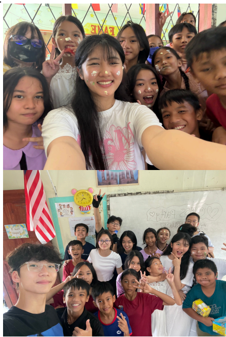
Teaching grade 5 students, and after party before graduation!