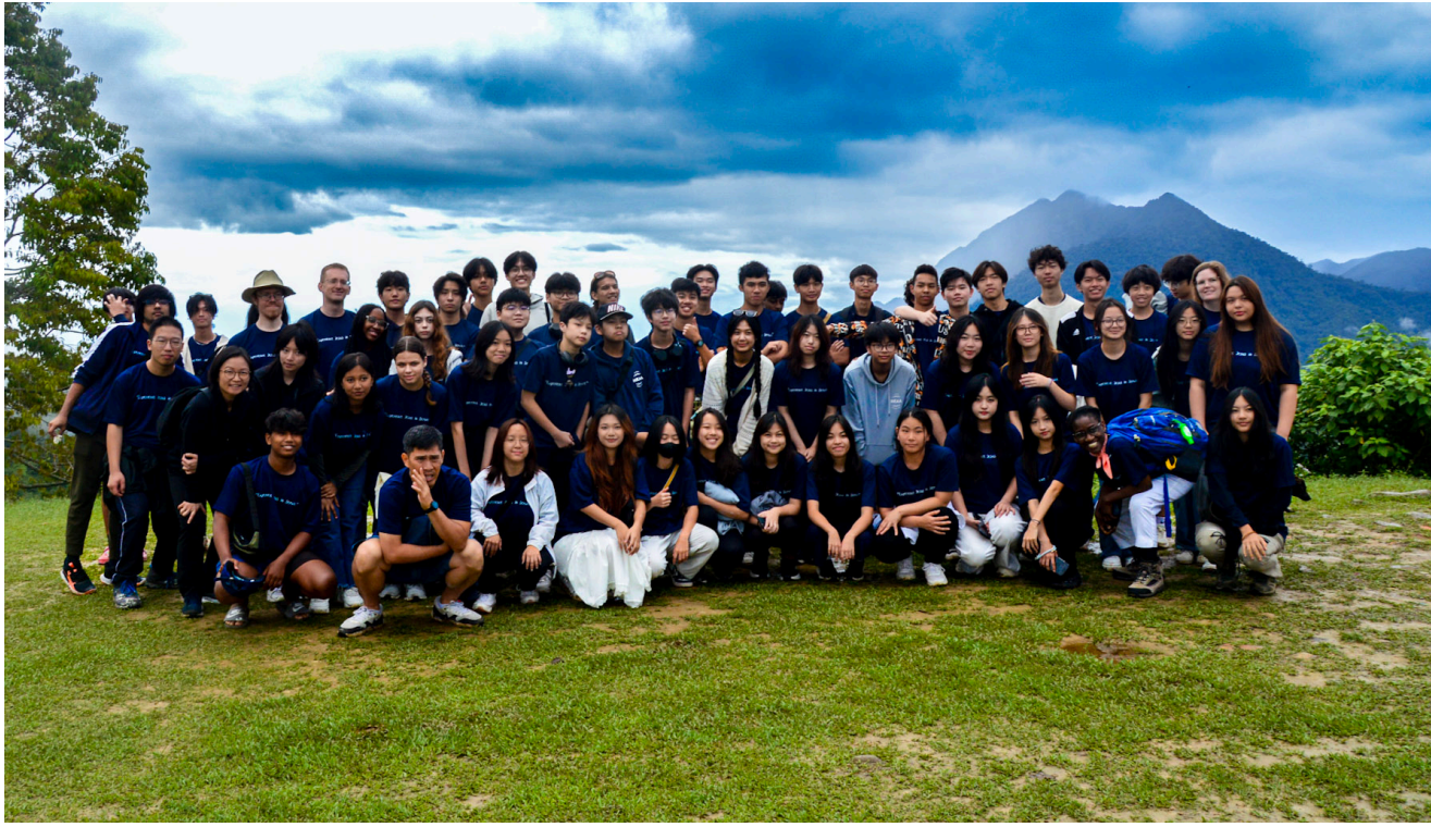
HKAA Highschool Mission Trip team at Mount Kinabalu!